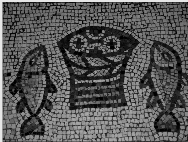
View of the mosaic below the altar of the church at Heptapegon/Tabgha that commemorates the multiplication of the five loaves and two fishes in the story of the feeding of the five thousand (Mark 6:33–44).